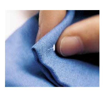
Temporary marking with Mark III Plus and Mark III Fine Fabric